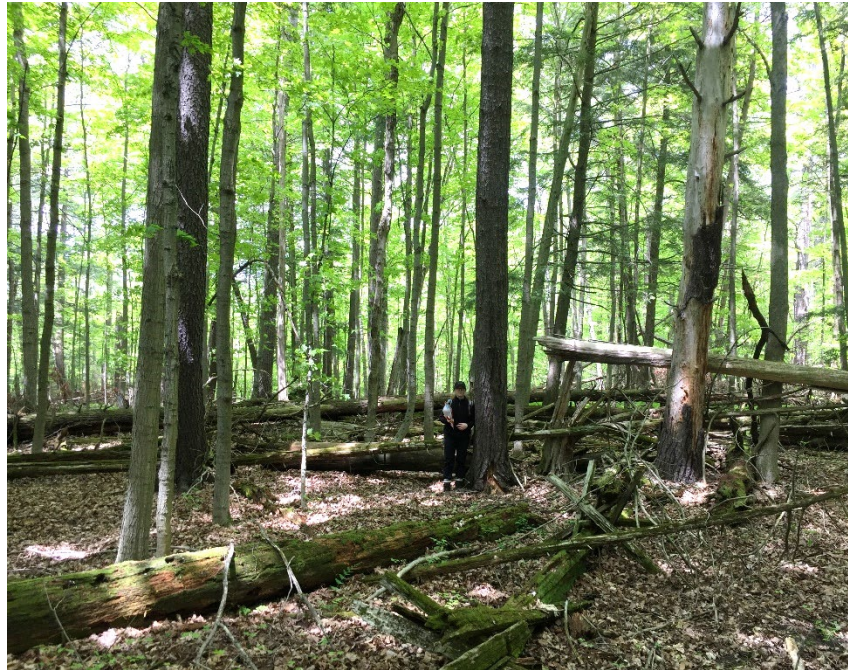
Figure 4. Area with abundant coarse woody debris.