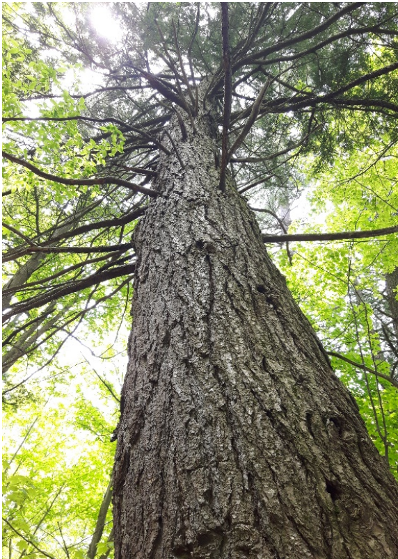
Figure 3. One of the eastern hemlocks measured.