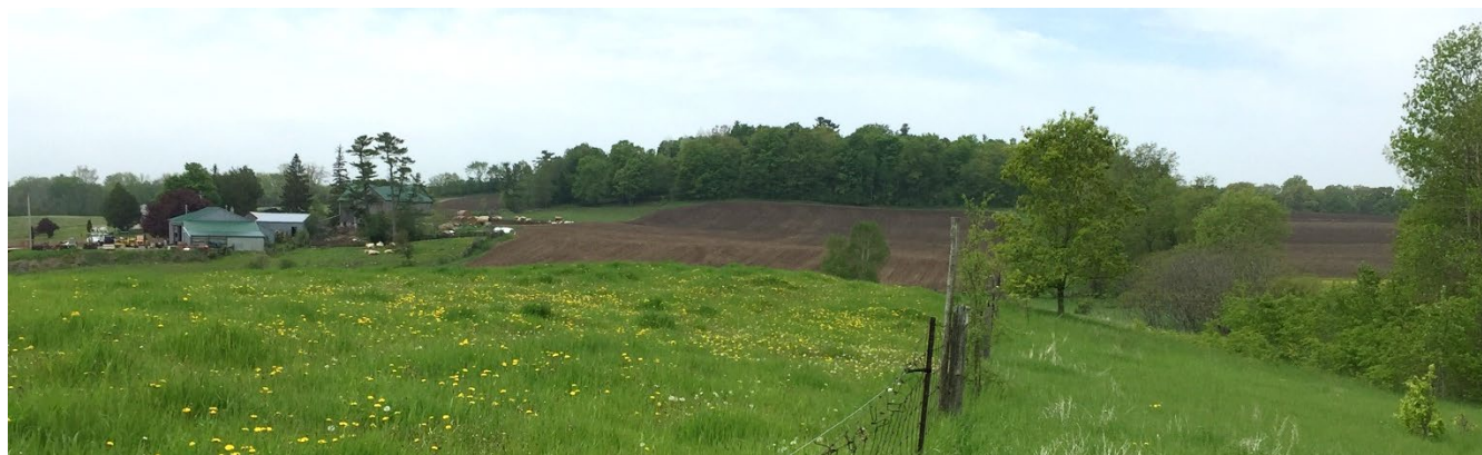
Figure 2. View of the forest from the abandoned access road.