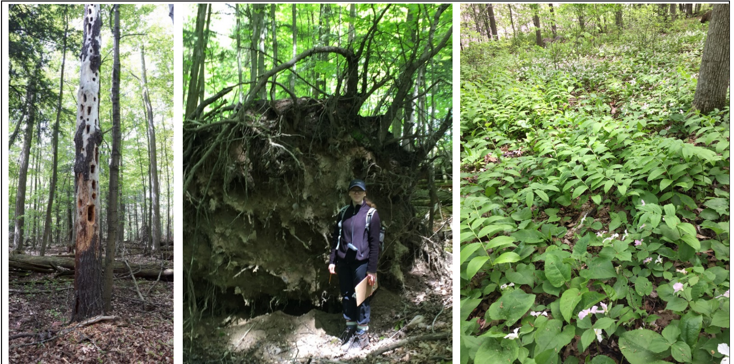
Figure 5. Left: a snag with numerous pyleated woodpecker holes. Centre: An uprooted tree that has created a pit. Right: A large patch of false soloman's seal and trillium plants.