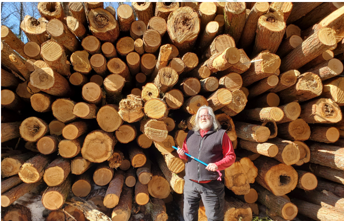
Image: from March 2021-AFER lead ecologist with harvested hemlock logs — hemlock is one of the least profitable of timbers.

The CFSC believes more logging will compromise the potential for the forest to reach an old growth state and the associated carbon sequestration, habitat, education and recreation values. While hemlock can grow to 600 years of age, logging will stunt this ability and likely encourage regrowth of more "profitable" timber species such as pine and hardwood. This is partly why old hemlock forests are so rare.