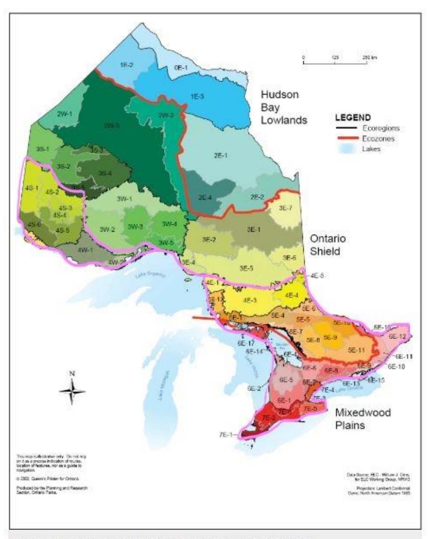
Figure 1. Ontario's Temperate Forest Region (within pink boundary; from MNRF (2019))

Figure 2: The ecozones, ecoregions, and ecodistricts of Ontario.