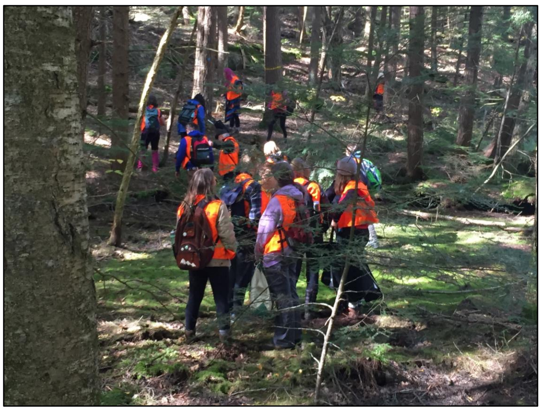
Youth Leadership for Sustainability Students, Catchacoma Forest (2019)