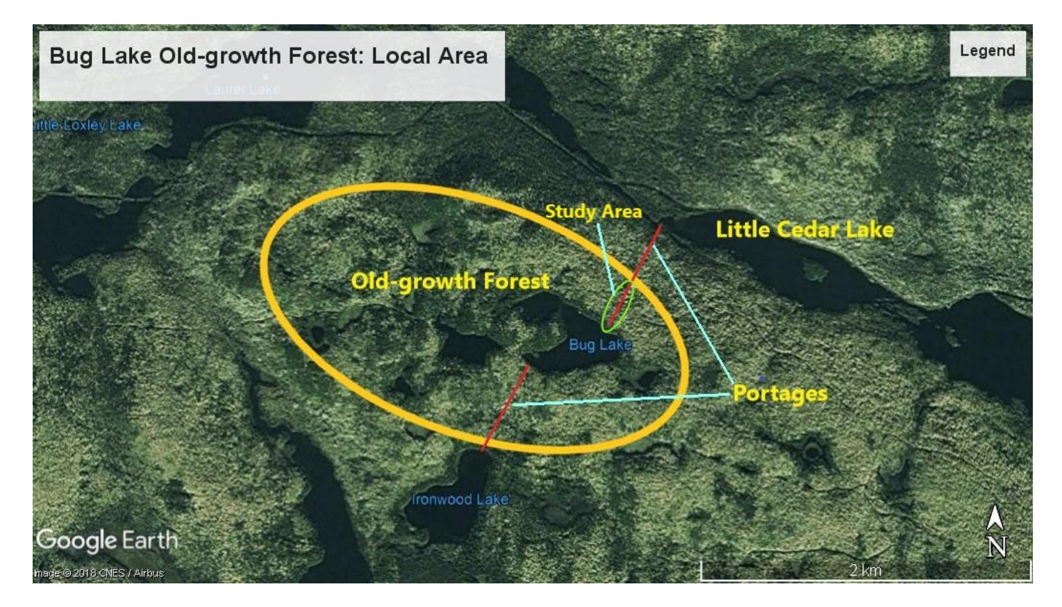
Figure 2. Bug Lake Old-growth Forest and Study Area