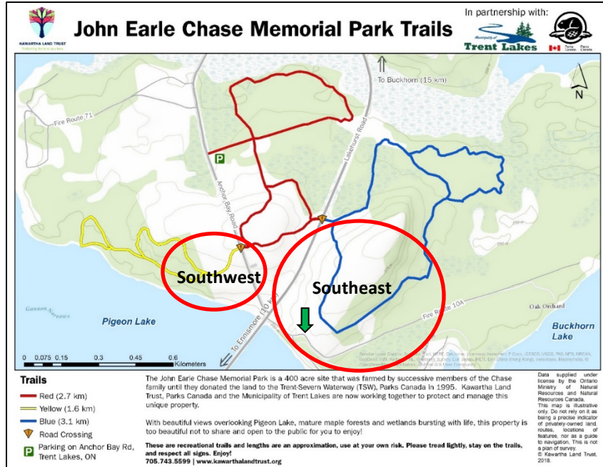
Figure 1. Map of John Earle Chase Memorial Park (Kawartha Land Trust, n.d.). Red circles indicate areas visited. Green arrow indicates a parking spot.