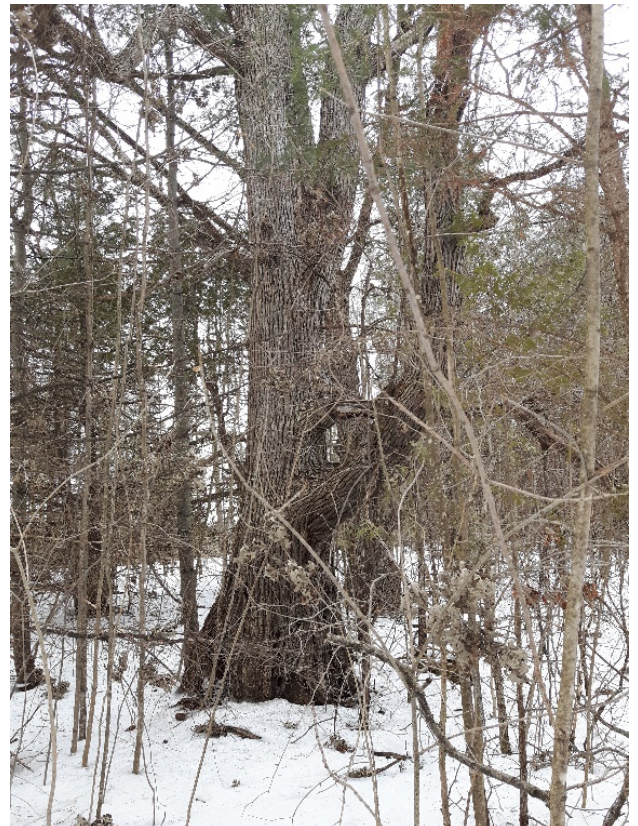
Figure 6. Large oak; notice buttressing at base.