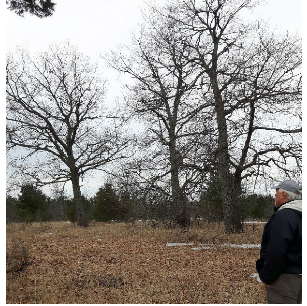
Figure 4. Oak stand