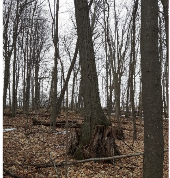
Figure 8. Red oak growing on a stump