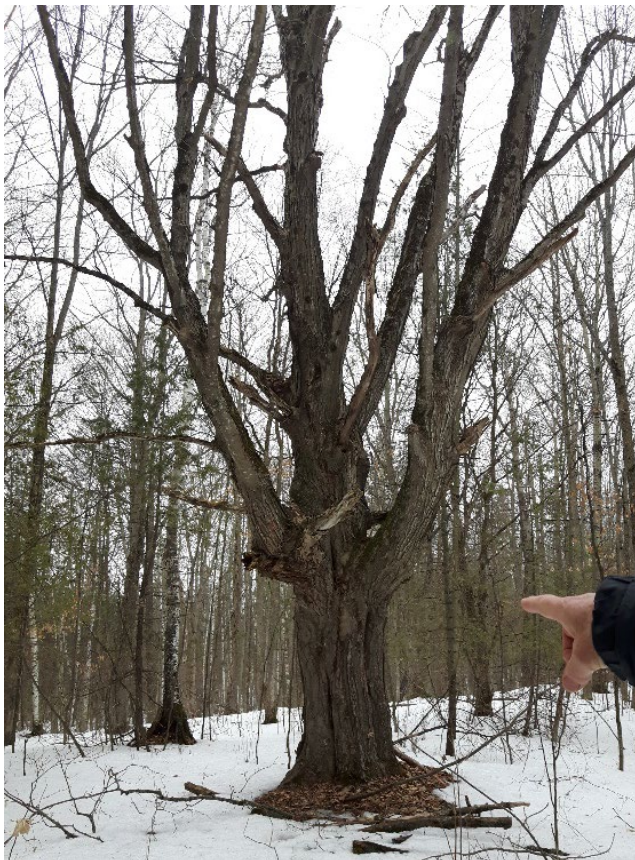
Figure 5. Large sugar maple (centre) and young paper birch growing on a stump (left).