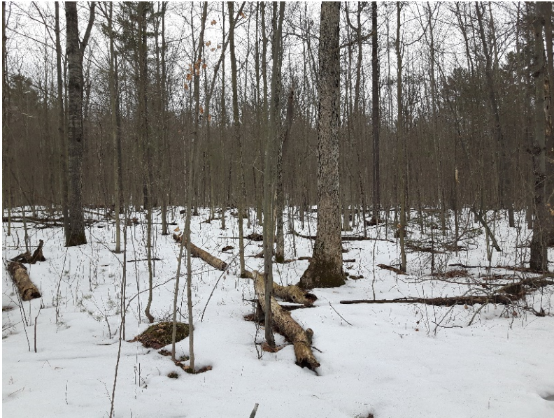
Figure 3. Downed woody debris