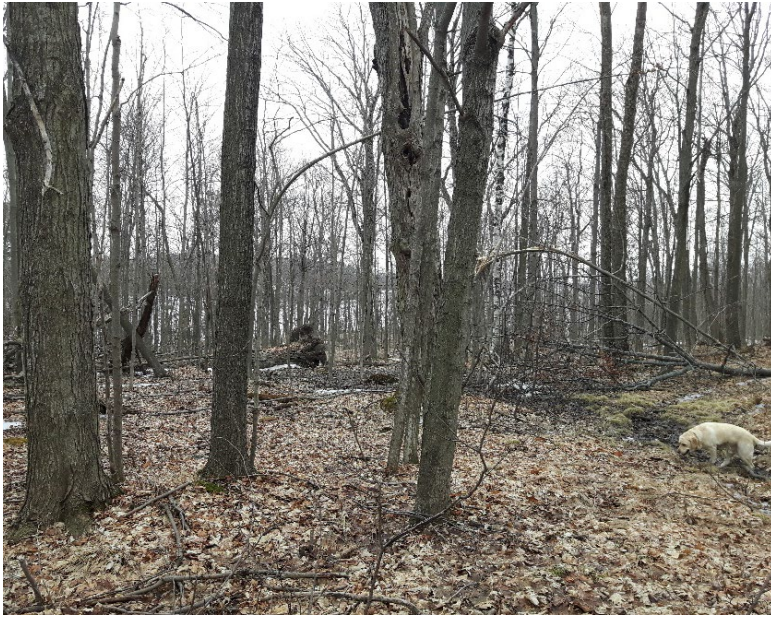
Figure 7. Blowdown area