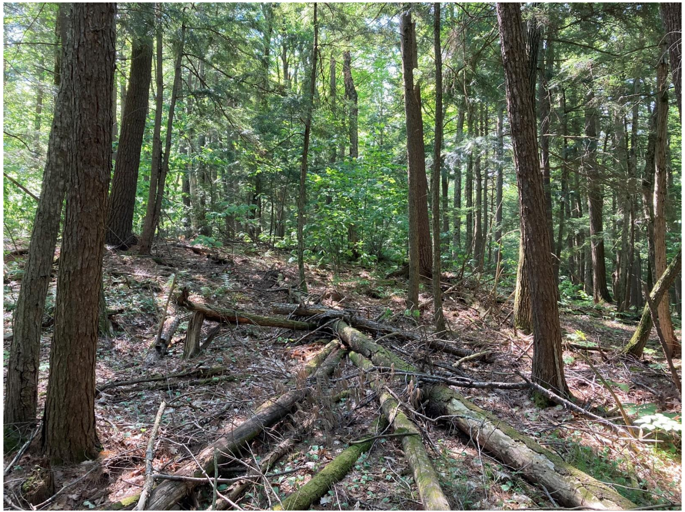
Catchacoma Old-growth Forest