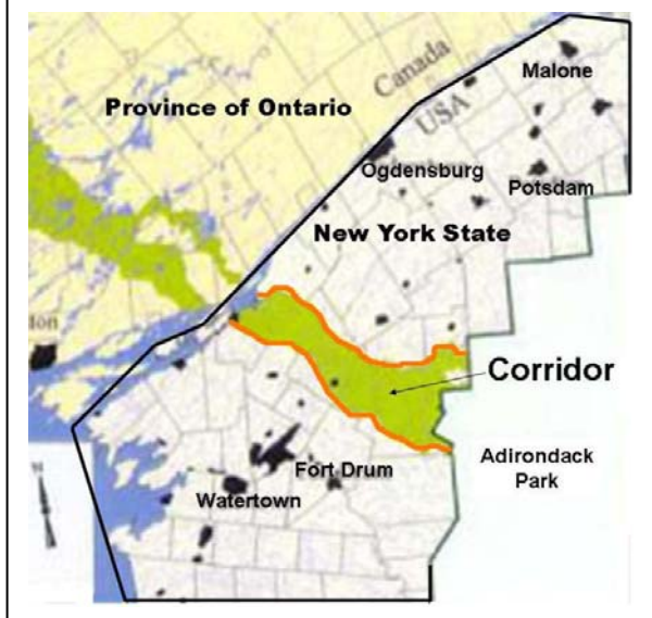
Figure 1. Four-County Study Area and Proposed A2A Corridor in New York State

York portion of the Algonquin to Adirondacks (A2A) Corridor (focus of this study), these features included road density, presence of major roads, human population density, land cover type (30 categories), and hydrology at 90 x 90 m cell resolution for more than 2 million cells covering the 19,865 km 2 study area. The proposed A2A Corridor (in New York) is ~55 km in length, with an area of ~1,045 km 2 , and varies in width from ~10 km at the northwest end to ~30 km at the southeast end. The Corridor location was selected primarily because of its high ecological integrity (lowest road density and human population density) relative to the other portions of the study area. The dominant ecosystem type within the study area and the A2A Corridor is maple-beech-birch forest (70% and 90%, respectively; Table 1). Of the 12 main ecosystem types in the study area, eight are well-represented (% difference <2%; Table 1) within the Corridor. However, the maple-beech-birch forest type is over-represented by ~20%, the spruce-fir (-3.96%), oak-hickory (-3.22%), and white-red-jack pine (-2.44%) forest types are all mildly under-represented, and non-forested